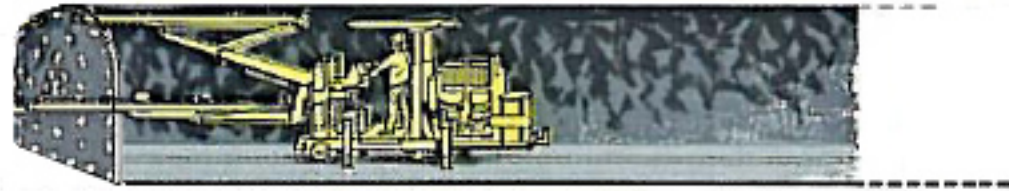
HAGGLOADER AND SHUTTLE CARS